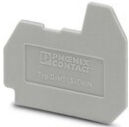
End cover, length: 27.8 mm, width: 1 mm, height: 24.3 mm, color: gray

Please be informed that the data shown in this PDF Document is generated from our Online Catalog. Please find the complete data in the user's documentation. Our General Terms of Use for Downloads are valid ( http://phoenixcontact.com/download )